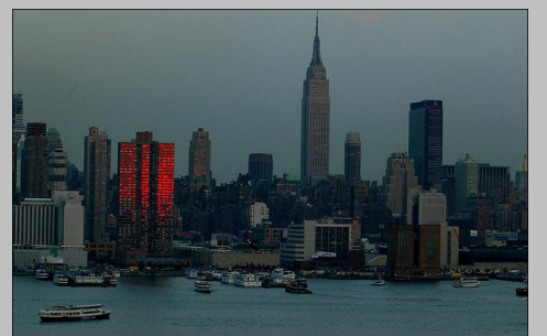
It's your Choice, don't be left in the dark...